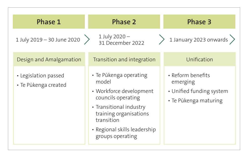
Figure 5 Three phases of the vocational education reform programme