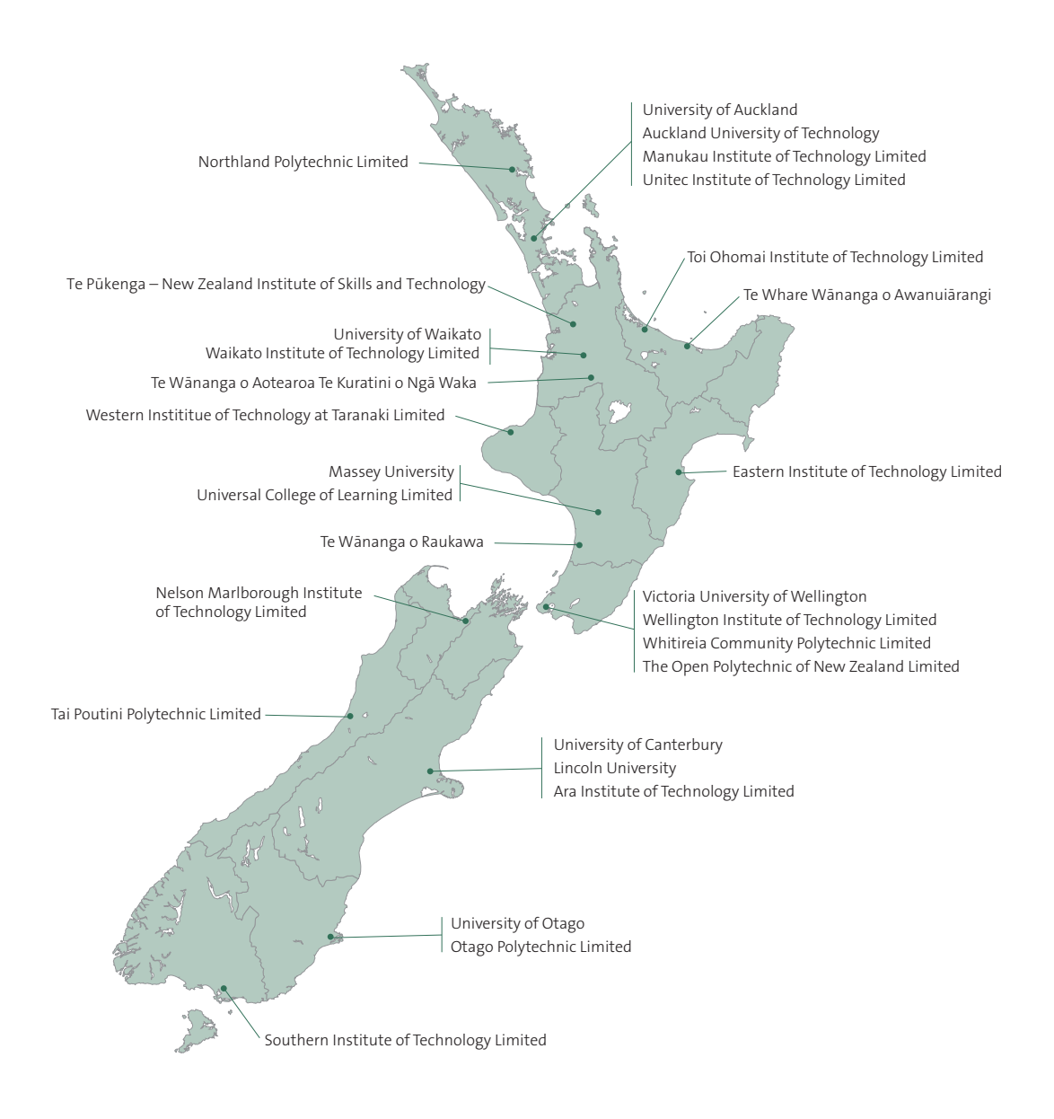
Figure 1 Main campus or headquarters of the tertiary education institutions in New Zealand