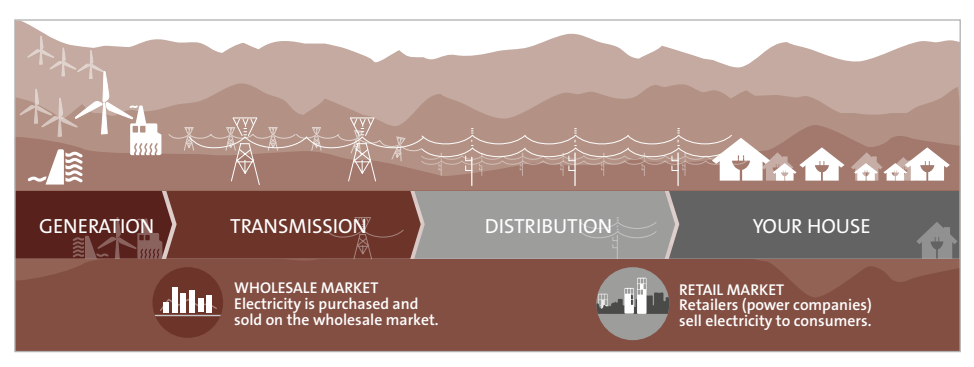
Figure 1 The structure of the electricity industry